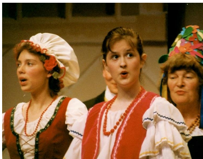
Yes, we wanted variety