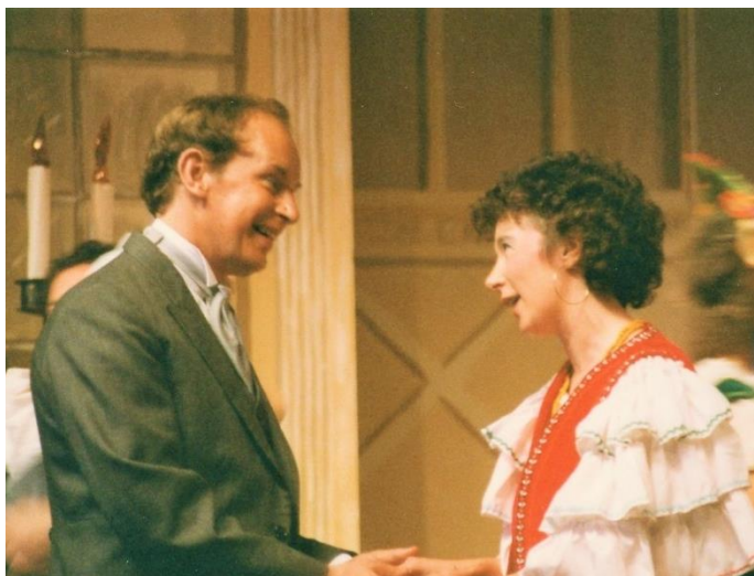
Though obedience is strong, curiosity's stronger