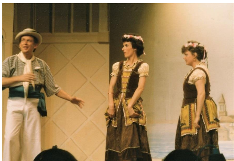
She'll drive about in a carriage and pair