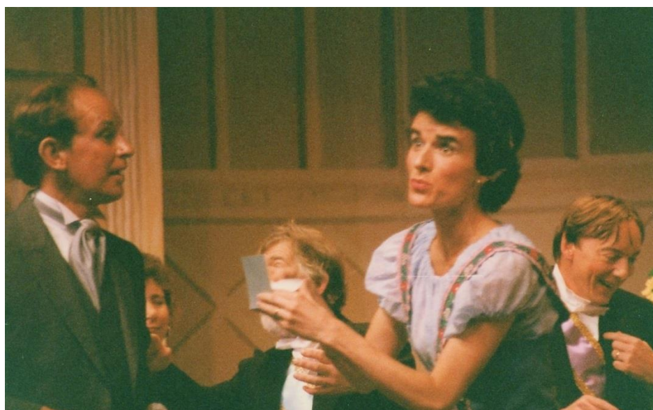
Everything is interesting, tell us, tell us all about it