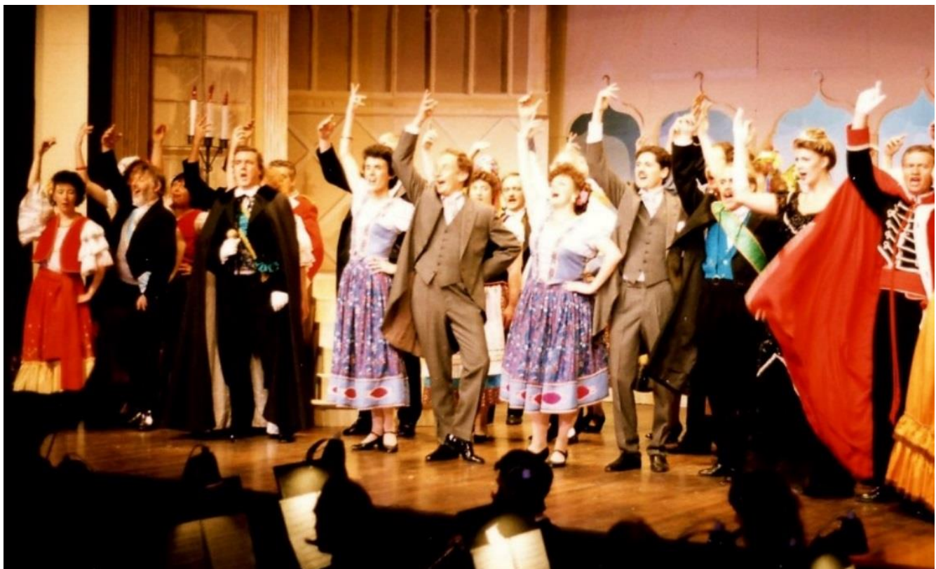
We leave you with feelings of pleasure