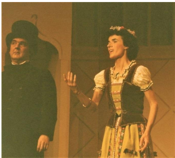
Kind sir, you cannot have the heart