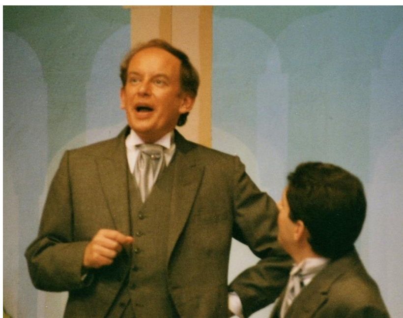
Take my counsel, happy man