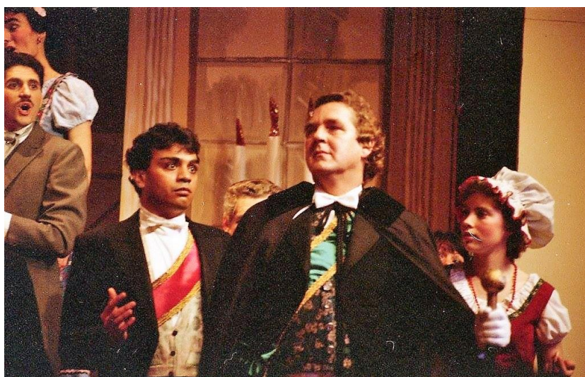
Now let the loyal lieges gather round