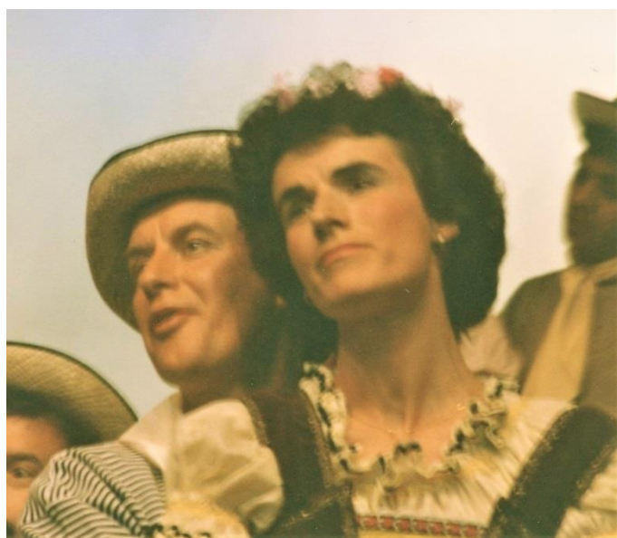
We'll not forget we've married ye