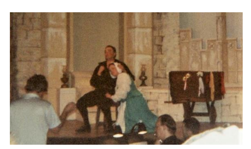
Were I thy bride