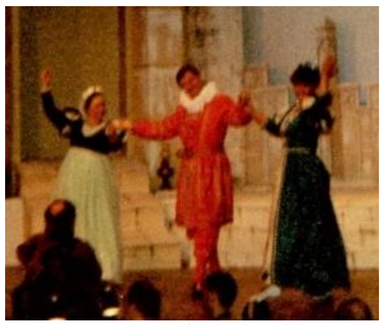
It is purely a matter of skill