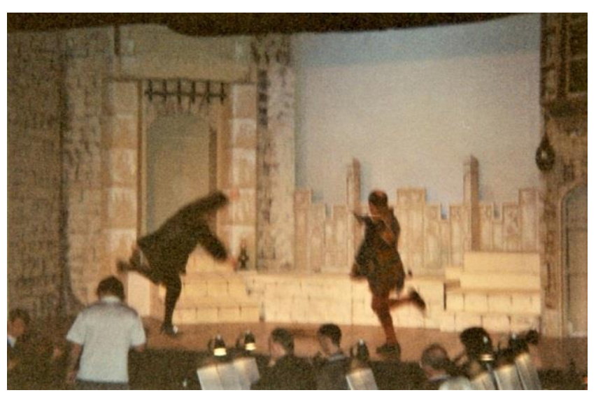
Tell a tale of cock and bull