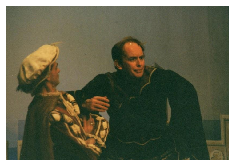
An upstart I can wither with a whim