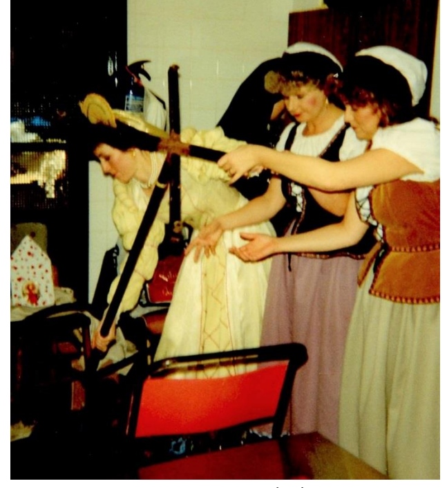
Answers on a postcard, please