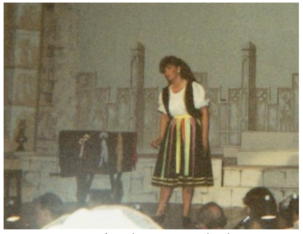
'Tis done, I am a bride