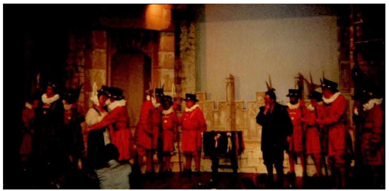
Aye, hug him, girl